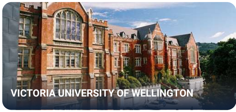
VICTORIA UNIVERSITY OF WELLINGTON