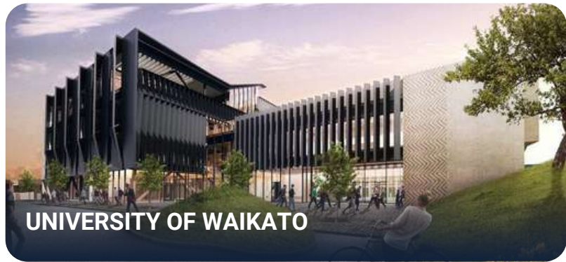
UNIVERSITY OF WAIKATO