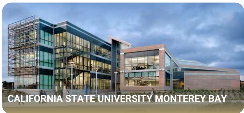
CALIFORNIA STATE UNIVERSITY MONTEREY BAY

Software Engineering, Game Development, Network & Security, Data Science