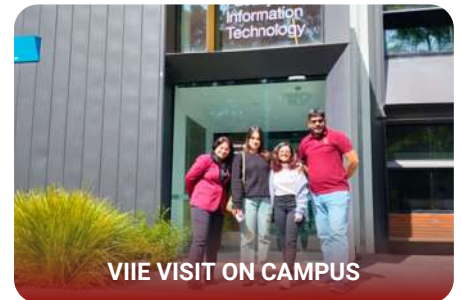
VIIE VISIT ON CAMPUS