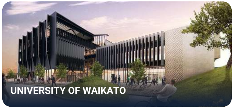
UNIVERSITY OF WAIKATO