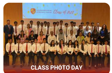
CLASS PHOTO DAY