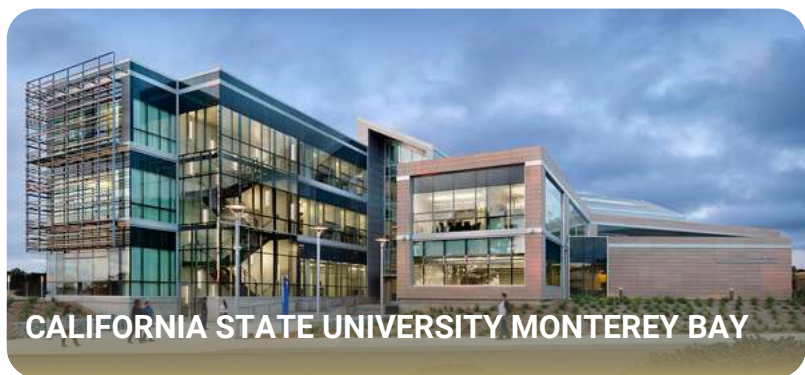
CALIFORNIA STATE UNIVERSITY MONTEREY BAY

Software Engineering, Game Development, Network & Security, Data Science