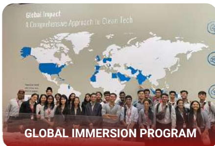
GLOBAL IMMERSION PROGRAM