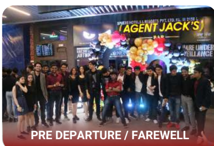
PRE DEPARTURE / FAREWELL