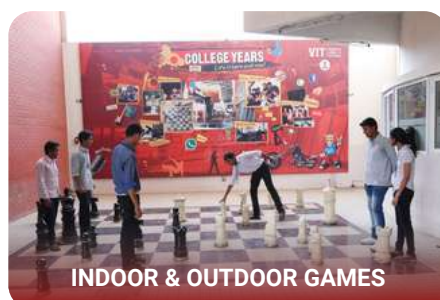
INDOOR & OUTDOOR GAMES