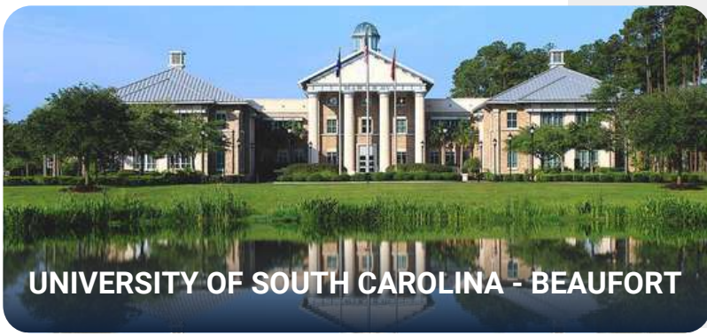
UNIVERSITY OF SOUTH CAROLINA - BEAUFORT