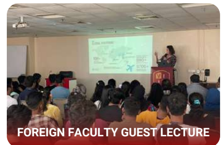
FOREIGN FACULTY GUEST LECTURE