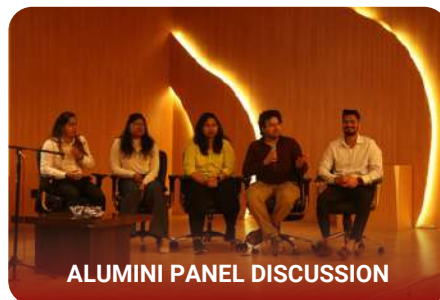
ALUMINI PANEL DISCUSSION