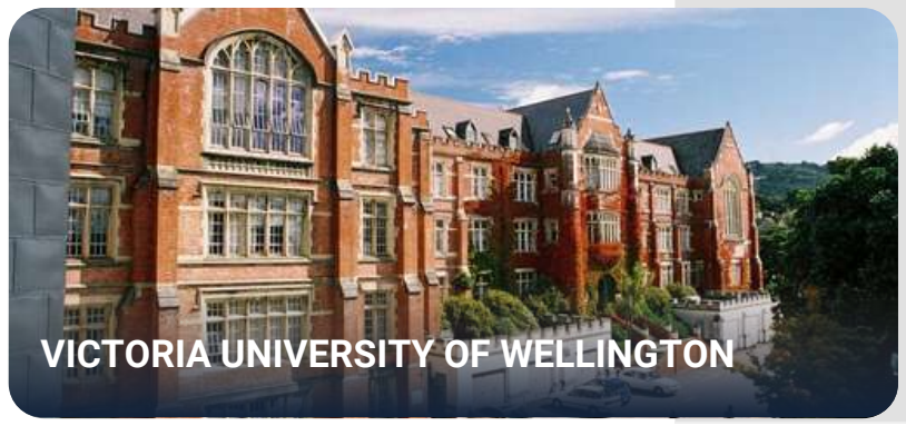
VICTORIA UNIVERSITY OF WELLINGTON